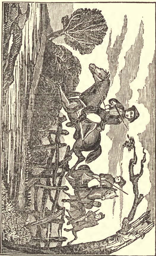
Marion leaping the barrier—page 46.